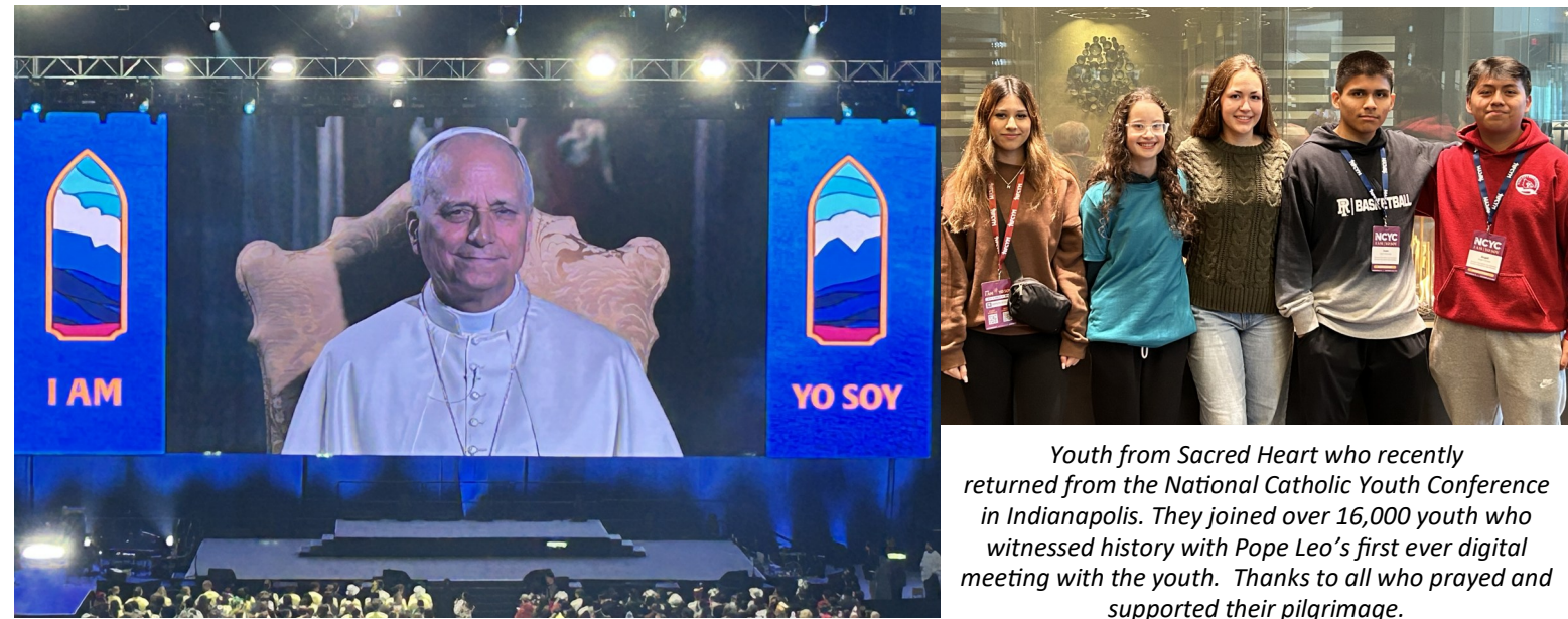
Youth from Sacred Heart who recently returned from the National Catholic Youth Conference in Indianapolis. They joined over 16,000 youth who witnessed history with Pope Leo's first ever digital meeting with the youth. Thanks to all who prayed and supported their pilgrimage.