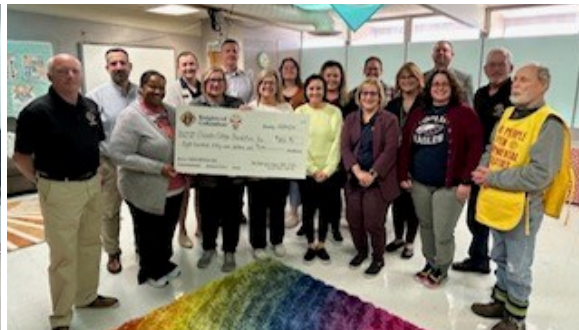
The 2023 Knights of Columbus Tootsie Roll Drive raised a total of $3344.58 thanks to the generosity of the community and the parish. Half of the proceeds help causes such as the Missouri Special Olympics. Community Support Services of Missouri and The Crowder College Foundation, local organizations that support people with intellectual disabilities, received the other half, $836.15 each.